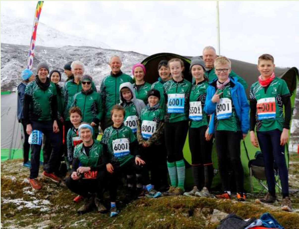
Club kit to the fore at JK Relay