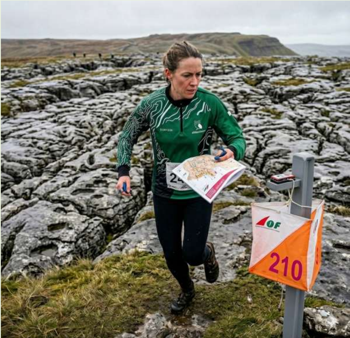
Picture of an unidentified Airienteer by Google Gemini AI (free version) in Thinking Mode.

I prompted Gemini AI to create 'an image of a woman about 35 - 40 years old running at this event on Carreg Goch, approaching a control and wearing this orienteering top',